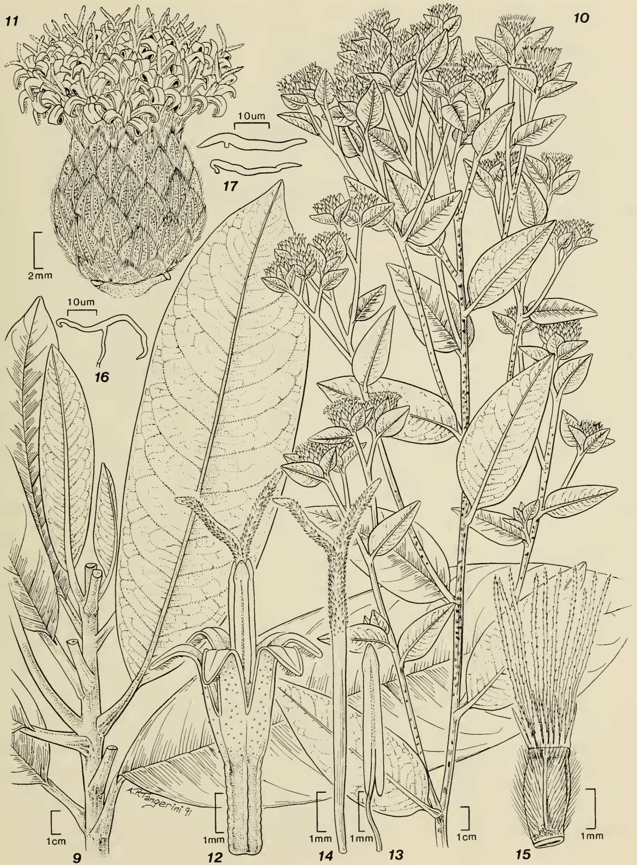
Figs. 9–17. Anteremanthus hatschbachii H. Robinson; 9. Section of vegetative stem; 10. Inflorescence; 11. Head, moist; 12. Corolla with anthers and style; 13. Anther; 14. Style; 15. Achene; 16. Trichome from lower leaf surface; 17. Trichomes from corolla lobe.